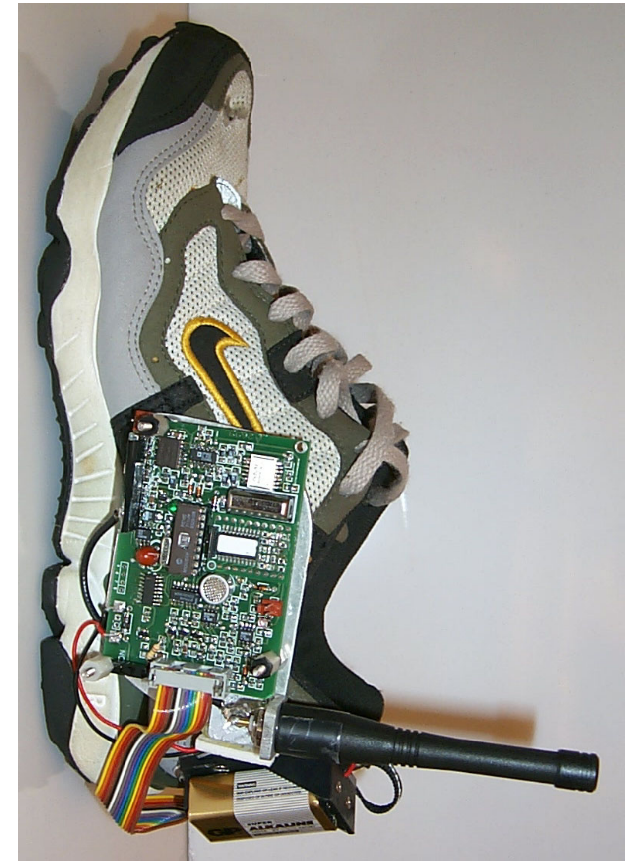
Photo 3: The Expressive Footwear - 16 diverse sensor channels wirelessly transmit from the foot of a performer for producing dance-driven interactive music