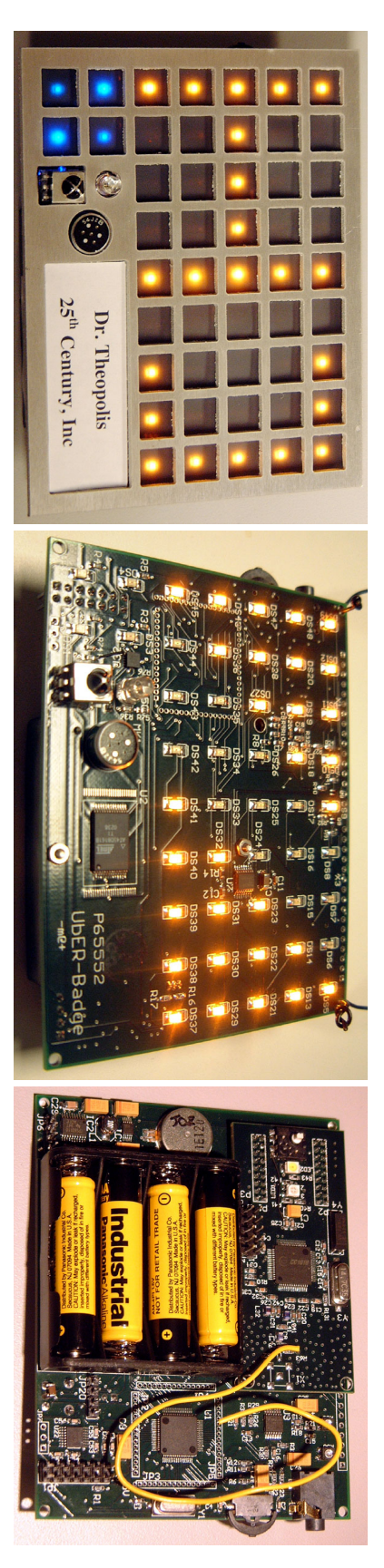
Photo 1: Photograph of a functional RFRAIN card (wire antenna protrudes from the right)

Photo 2: The UbER-Badge - with cover (left), without cover (center), and rear (right)