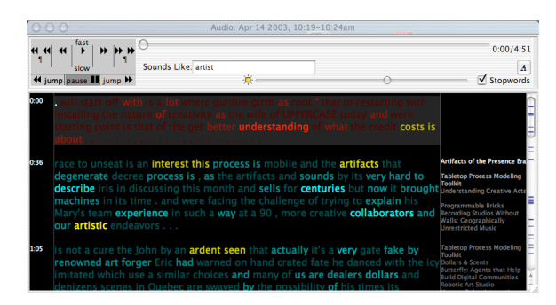
Figure 3: Interface for browsing, searching, and playing an individual recording

Several features are included to improve the utility of the speech-recognizergenerated transcripts. A juncture-pause-detection algorithm is used to separate text into paragraphs. Next, similar to the Intelligent Ear [25], the transcript is rendered with each word's brightness corresponding to its speech-recognizer-reported confidence. A "brightness threshold" slider allows users to dim words whose confidence is below the threshold. This can be used to focus attention on words that are more likely to be recognized correctly. Next, an option to dim all English-language stopwords (i.e., very common words like "a", "an", "the", etc.) allows users to focus only on keywords. A rudimentary speaker-identification algorithm was included and the identifications are reflected as different colored text (seen as red or aqua in Figure 3).