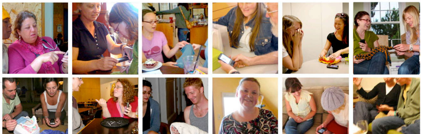
Figure 4. Participants during the gift exchange in Phase 4.

We tried to give our participants as much flexibility as possible to determine the creative and temporal constraints of the craft project. In order to compare aspects of the craft process across subjects, we asked creators to use Spyn for at least two weeks, and to log their activity in a journal every day (whether or not they used Spyn). Paper diaries [6] were used to gain more insight into the creators' experiences with Spyn when we were not present and provoke reflection on their use of Spyn. Questions included: “How comfortable were you using Spyn today?” and “How do you think the recipient of your craftwork will interpret these memories?” The diaries effectively provided us with data surrounding the two-to-four week creation process, such as how their understanding of the system changed over time. We conducted a situational analysis [8] of field notes, interview transcripts and diary entries. We then iteratively developed a set of (non-mutually exclusive) categories for the content of the Spyn memories.