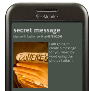
Figure 6. Jane’s “secret message”

Penny (recipient): Rather than viewing the gift as a single object, I felt as if I was given the present of captured time.