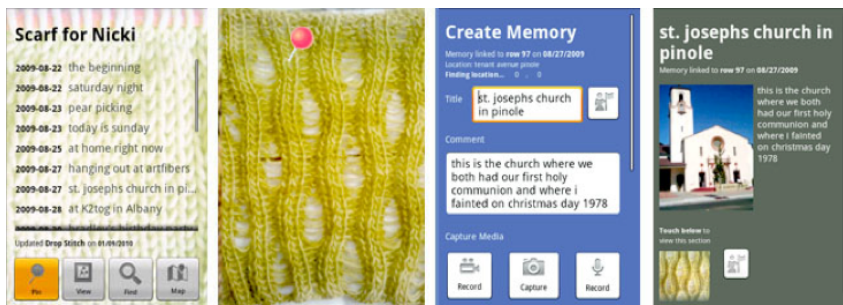
Figure 3. Screenshots of Kyla’s Spyn project (left to right) (a) Spyn home screen, (b) pinning garment, (c) creating a new Spyn memory, and (d) viewing the Spyn memory.

our current study involves both the creator and recipient of a craft object, further investigating the creator-recipient relationship over two-to-four weeks. Specifically, we study the following questions: