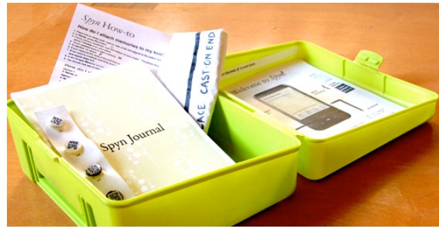
Figure 5. The Spyn "Kit". The kit contained support materials for the Spyn software and a journal for documenting daily activity with Spyn. Support materials included barcode "buttons" (for switching projects), a scanning guide (for gauging the viewfinder's distance from the garment), and instructions for using Spyn.

On average, creators used Spyn for 3 weeks; one person (Fay) used Spyn for 14 days and one person (Carrie) used Spyn for 28 days. All participants took the Spyn projects quite seriously—creators spent significant time creating