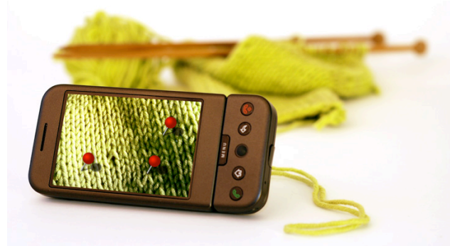
Figure 1. The current Spyn system runs on Android 1.5 G1 phones; vision recognition correlates recorded media with locations on fabric.

Copyright 2010 ACM 978-1-60558-929-9/10/04...$10.00.