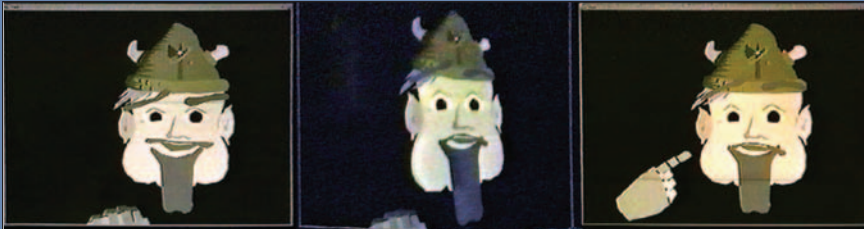
Figure 2b: Gandalf is "massively interactive," reacting believably to anything from the user's subtle eye movements (e.g. a glance over to the solar system), to a full communicative act such as questions about the planets.

explicit representation of each module's contextual behavior, and carry with it their state, so the blackboard provides a localized recording of all system events and system flow. Messages effectively implement APIs between the system's modules, specifying their interactions at the content level, through a unified protocol. Combined with blackboards, a publish-subscribe architecture is thus a powerful tool for incremental building and debugging of interactive systems. We take advantage of this fact with a web-based system inspector, which can display the state of modules while Psyclone is running. This facility has turned out to be invaluable for debugging, since the path of decisions, embodied in the message flow, can be inspected directly. Also, this tool works from a remote location, which can be very useful on systems where the machines are geographically disparate. The architecture of Psyclone is shown in Figure 3.