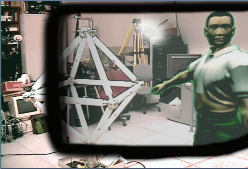
Figure 4: Mirage, seen through the LCD screen of the "magic glasses" that reveals the agent to the user. (Image has been digitally enhanced for clarity.)

important as more third-party modules become available and manual maintenance of semantics becomes impractical. Other planned enhancements include extending Psyclone to support a large number of modules (thousands or tens of thousands in mixed configurations, including single/multiple modules per executable), running on a large number of computers.