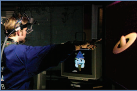
Figure 2a: The Gandalf character interacting with a user, who is asking Gandalf to tell him about the planet Saturn. Gandalf's rich multimodal perception and multimodal output enables him to generate dialog behavior akin to that observed between two people. A special body-tracking system, including gloves, jacket and eye tracker, provide Gandalf with enough fine-grain perception to allow highly reactive behavior, in addition to deliberative actions.