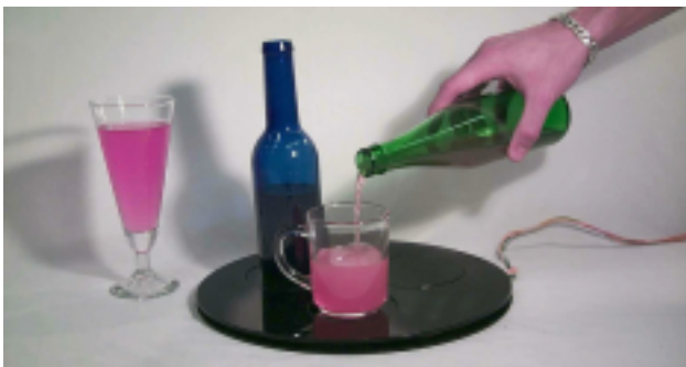
Figure 1: The mixing station with two modifier bottles.

Currently, information is transmitted from the mixing station and coasters to the computer in real time through a serial connection. Eventually, this data transmission will be wireless. On the software side, a Java-based application controls both the audio mixing and playback.