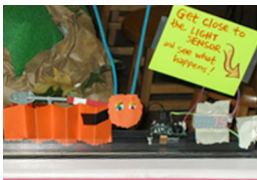
Figure 10 A caterpillar triggered by a light sensor. The message reads, “Get close to the light and see what happens!”