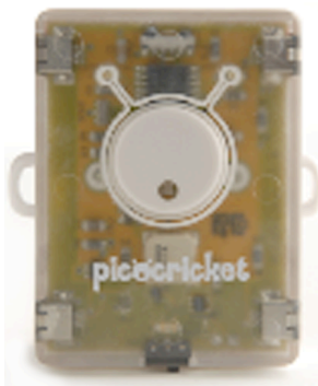
Figure 3 PicoCricket.

More recently, we have been involved in the development of a new type of robotics construction kit that explicitly aims to combine art and technology, enabling young people to create artistic creations involving not only motion, but also light, sound, and music. At the core of this new kit is a small programmable device called a PicoCricket (Figure 3), which children can embed in their physical creations ( http://www.picocricket.com ). Children can connect PicoCricket output devices (such as motors, colored lights, and music-making devices, Figure 4) and sensors (such as light sensors, touch sensors, and sound sensors, Figure 5) to the PicoCricket, then write simple computer programs to tell the PicoCricket how to behave.