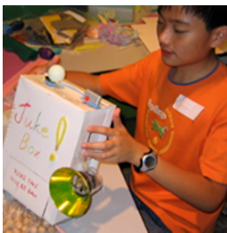
Figure 1 A jukebox that uses PicoCrickets and craft materials in a “wearables” workshop.

Traditional robotics activities tend to be more appealing to patterners. But the same technologies, if introduced in the appropriate way, can also be appealing to dramatists. For example, in a workshop based on an amusement-park theme, one group of students took a patterner approach, building a merry-go-round and then programming it to turn a specified number of