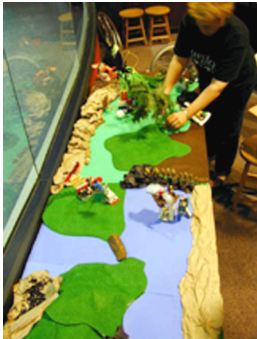
Figure 9 Setting up the park landscape.

On the first day, we showed several examples of PicoCricket projects around the theme of Birthday Surprises. The girls all became fascinated with one of the projects: a birthday cake that plays a Happy Birthday song when you blow out the “candles.” The cake used a sound sensor to detect the blowing and flickering lights to represent the candles. The girls decided that they wanted to create their own cakes. One pair of girls focused on decorating their cake with colored gem stones (Figure 11). Another group planned a “Hello Kitty” cake, but invested most of their effort in programming the music for the birthday song. A third group, inspired by their interest in the local Boston Celtics basketball team, created a cake with the Celtics logo and colors.