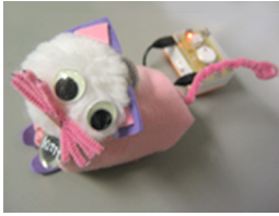
Figure 6 Cat made with PicoCricket, light sensor, and sound device.

For example, a young person might create a cat using craft materials, then add a light sensor and a sound-making device (Figure 6). She could write a program (using the PicoCricket's easy-to-use graphical programming language) that waits for the light sensor to detect someone petting the cat, and then tells the sound box to play a meowing sound (Figure 7).