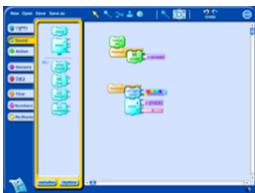
Figure 8 Software for programming PicoCrickets.

Although the activities might seem different on the surface, programming a cat to meow when you pet it is actually quite similar to programming a robot to react to an obstacle, in terms of underlying computer-science concepts. For example, to tell a robot to change direction when it hits the wall, a program could wait until the touch sensor is pressed, then tell the motors to reverse direction. The program for the cat waits until the light sensor detects low light, then tells the sound box to play a sound. The programming skills and concepts are the same, only the context is different.