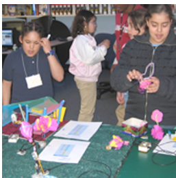
Figure 12 Girls get ready to share their “secret garden” robotics projects at the open house.

At the open houses, the girls showed pride in demonstrating their projects. The boys from the Boys and Girls Club had never seen the PicoCrickets before, so they began asking questions about how the technology worked, providing the girls an opportunity to share what they had learned (Figure 12).