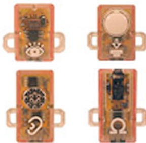
Figure 5 PicoCricket sensors: light sensor, touch sensor, sound sensor, and resistance sensor.