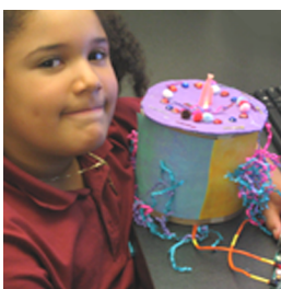
Figure 11 A birthday cake programmed with lights and music.