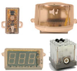
Figure 4 PicoCricket output devices: multi-colored light, sound box, numerical display, and motor.