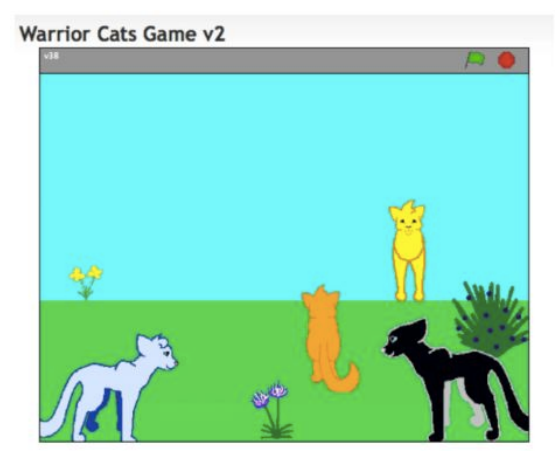
Figure 3: Sample Warrior Cat projects from the Scratch community

More than 1500 members of the Scratch community had played with the Warrior Cats Game v2 project, and they left more than 100 comments and suggestions. In response to a comment that said simply Awesome! , Flamespirit encouraged the commenter to try out a new, enhanced version of the project: Posted v3. It has an extra level you'll love. Check it out!