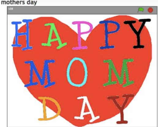
Figure 1: Sample Mother's Day projects from the Scratch community

Another project was an extended story in which a Scratcher explains how she had searched online to find the correct date for Mother's Day. The project includes photographs of her room and the computer on which she did the search, along with sound effects to simulate her keystrokes as she types the search query into the computer. The story ends with a cartoon image of herself saying "I love you SO much!" with arms stretching across the screen to show how much she loves her mom.