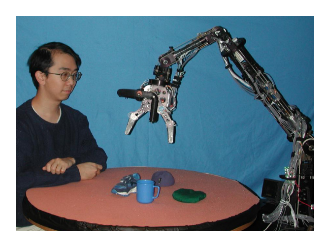
Figure 1: Ripley looks down at objects on a tabletop.

the following notation in order to describe the simulator and its interaction with Ripley's perceptual systems.