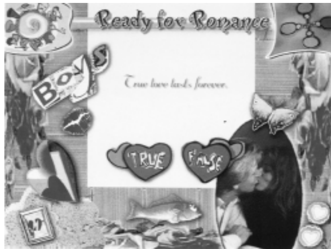
Figure 3: Let's Talk about Me Software

Another game from the same era that also relied on research about girls' stereotypical interests, was called Talk About Me. The heroine of this game is the player herself who can look up horoscopes, answer quizzes about romance, read interviews with potential role models who talk about how they mix family and work, and test out clothing mixes and matches. The software also has a space for the girl to keep a diary.