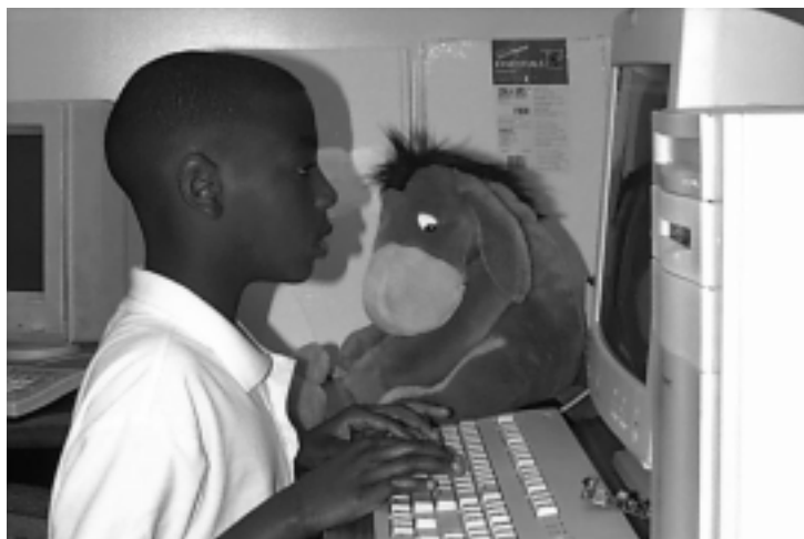
Figure 5: the Rosebud System

The collaboration between child, computer and stuffed animal ends with the child recording the story in her own voice--the story is saved into the stuffed animal and the child can then ask the stuffed animal to repeat the story back to her. Rosebud supports storytelling by one child and one stuffed animal, but also by multiple children each with his/her own stuffed animal, working together. In this literal sense of 'voice' and in the metaphoric sense, Rosebud encourages the establishing of voice through an open-ended storytelling framework for the child. It promotes collaborative learning, not only among several users and through peer review, but through presenting the computer as a supportive learner partner rather than as an authoritative viewpoint. Rosebud focuses on collaboration by allowing multiple-toy use and multiple-author storybooks, so that several children can write a story together about all of their stuffed animals. Likewise, since the toy serves as a storage device, children can trade their stories by lending their stuffed animals to a friend.