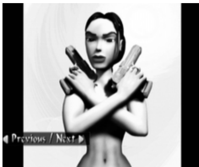
Figure 5: Lara Croft, Tomb Raider