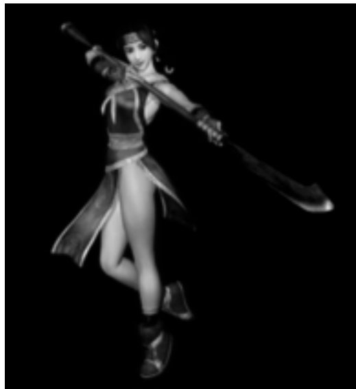
Figure 4: Female Fighter from Soul Caliber (released Sept. 1999)

The girls are babes in our game; they're babes. You know, they have big breasts and they wear scanty clothes. But the clothes don't fly off and that kind of stuff. I don't have a problem with representing women as babes, because when I go to the gym that's what they look like. They're not "gorgeous-gorgeous" but they're built. And if you were a real martial arts contender, you'd be built too (Glos & Goldin, 1998).