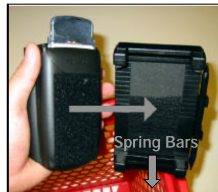
Figure 3: Attach the PSA to the basket Mount as shown. You'll need to push down the spring bars before the PSA will fit.