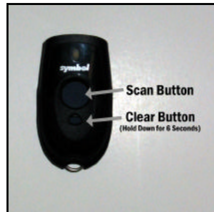
Figure 1: The Symbol CS1504 Barcode Scanner. Hold down the clear button for 6 seconds to clear the scanner's memory.