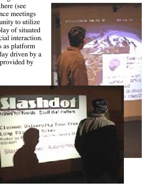
Figure 2: Transitional Interaction - a weather map triggered by the user walking by vs. a news article shown when the user lingers to browse. Notice a potential design element: shadows of prior viewers, cast on the article could be used to gauge community interest in current stories.

Figure 1: The Garden workspace with projected display in the hallway