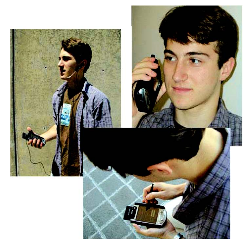
Fig 4 SimPhony used in a variety of styles from audio only, to audio and visual, to visual only.

Visual feedback (pop-up boxes or system messages which indicate the state of the system) was not a solution to distinguish the two states because it would require that the user look at the screen to understand the system's state; either audio or tactile feedback was required. Since all of the commands were short, we chose to make the command mode push (and hold) to talk. To issue commands to the system, the user must push the button on the side of the PDA and hold it as the command is given. Releasing the button signals the system to process the command and results in either audio feedback that the appropriate action has been completed or in an error sound. When sending voice or to record a message for a buddy, firstly audio feedback is received that the system is ready to record and, instead of pushing and holding the button while talking, the user simply pushes the button once and the system begins recording and/or transmitting.