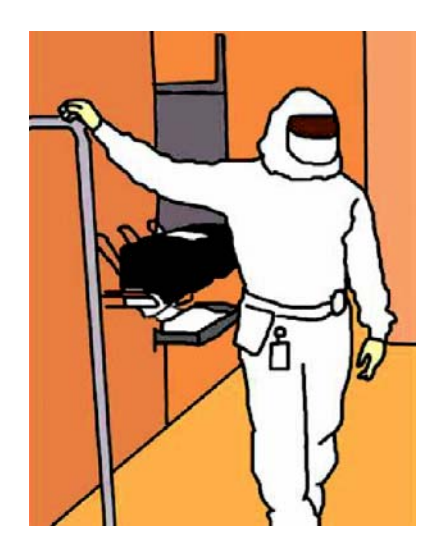
Fig 1 Full body 'bunny suit' worn by techs while in the fab.

Lots are easily susceptible to damage and as a result, clean rooms must be free of dust, debris and static at all times so as not to contaminate the microchips. Workers undergo a strict, lengthy, and costly cleaning process before entering the clean room and while inside are forced to wear 'bunny suits', shown in Fig 1, covering their clothing, shoes, hands, and head. These suits limit not only their ability to do any precision input, but also their peripheral vision and movement. The cleaning process makes it difficult for others to enter the fab and for workers to easily move in and out. In addition, the