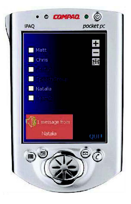
Fig 3 SimPhony user interface shown on a PDA.

The system allows for distributed one-to-one and one-to-many communication in a variety of styles from voice instant messaging to full duplex audio. It allows users to create lists of 'buddies', similar to commercial IM clients to whom they have quick communication access and a higher level of communication awareness through the system. Figure 4 shows SimPhony being used in several modes.