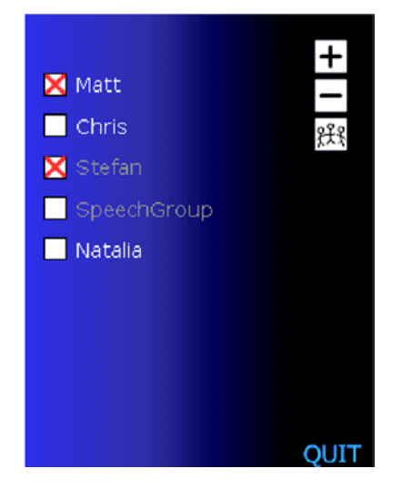
Fig 5 The main screen of the SimPhony user interface.

From the main screen shown in Fig 5, users can perform several actions or configurations. To create a group, a user selects the check box next to the names of as many buddies as wanted and names the group. Screen menus support all of the actions accessible by voice commands. Clicking on a buddy's name pops up a menu that allows the user to text, voice message or directly connect to another buddy or a group. When the user records a message or chats with a buddy/ group, the screen reflects the active state by showing a box with the name of the person or group. Beginning and ending recording is indicated with a tone, in the case of a voice message, and with a flashing LED on the PDA. In a synchronous connection, a tone is used only when the session begins and ends but transmission is indicated by the same flashing LED. When a user receives a voice message, a message box pops up with the name of the sender. Clicking the audio icon on the box plays the voice message. Alternatively, a voice command will accomplish the same task.